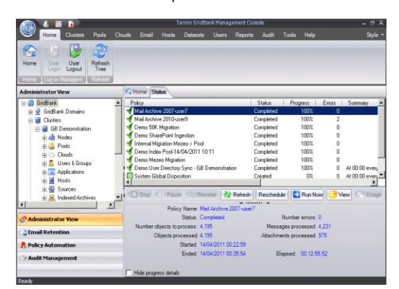
Figure 1: GridBank Management Console

With legacy systems and cost of primary storage capacity driving adoption of user inbox quotas, often users manually archive emails into .PST files. These files proliferate across networks, and could be stored anywhere. Searching and analyzing these .PST files in the event of litigation is time-consuming and costly for IT staff. Delays in providing these files to the legal department internally reduces the time available for analysis and review of the information, handicapping the legal department in case preparation, while failure to produce emails externally in a timely fashion can lead to fines